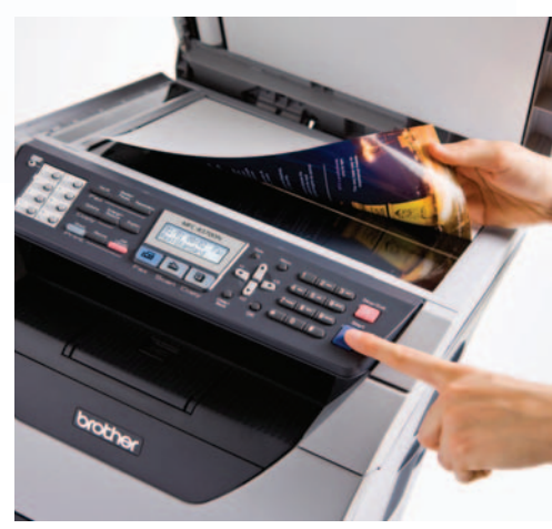
Scan your A4 colour documents.

High speed all-in-one performance with this compact, reliable mono laser multi-function centre® offering professional quality and low running costs.